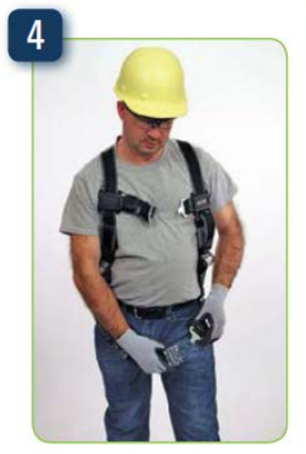
Pull leg strap between legs and connect to opposite end. Repeat with second leg strap. If belted harness, connect waist strap after leg straps.