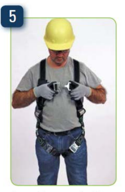
Connect chest strap and position in midchest area. Tighten to keep shoulder straps taut.