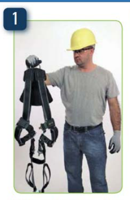
Hold harness by back D-ring. Shake harness to allow all straps to fall in place.

All work shall comply with the EH&S Safety Manual. The below is an attempt to summarize a portion of the Safety Manual specific to this topic, but not intended to replace the Safety Manual. A copy of the Safety Manual is available from your supervisor or EH&S.