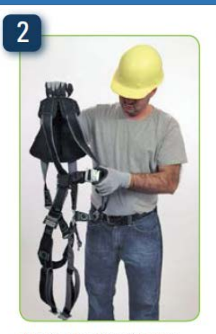
If chest, leg and/or waist straps are buckled, release straps and unbuckle at this time.