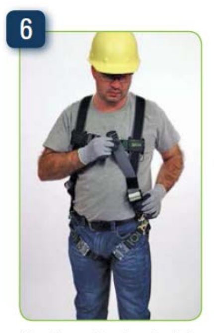
After all straps have been buckled, tighten all buckles so that harness fits snug but allows full range of movement. Pass excess strap through loop keepers.